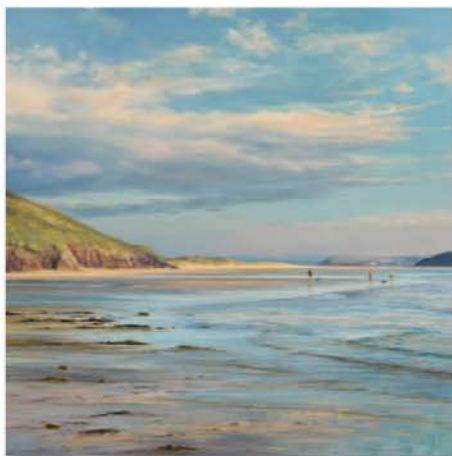
'EVENING LIGHT ON THE CAMEL ESTUARY' 16" x 16" oil on board by DUNCAN PALMAR £2250.00