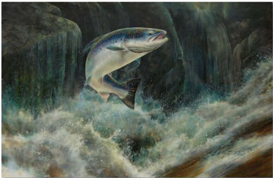
'SALMON OVER FALLS' 24" x 36" oil on canvas on board by CHRIS SHARP £2750.00