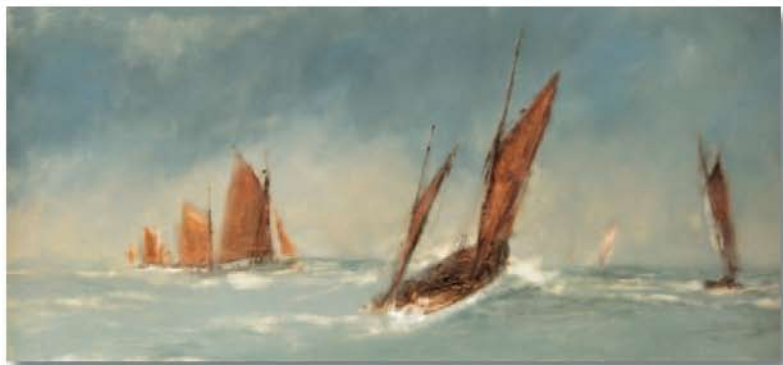
'TRAWLERS AT SEA' 20" x 44" oil on board by ANTHONY AMOS £1950.00