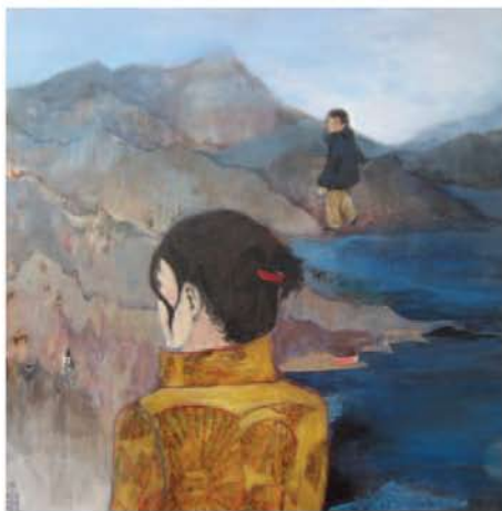
'STEEP NAVIGATION' 20" x 20" acrylic and collage on box canvas by JUSTINE FORMENTELLI £1250.00