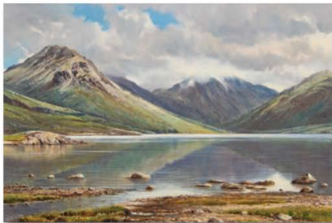
'MIRRORED MOUNTAINS ON WASTWATER' 12" x 18" oil on board by DUNCAN PALMAR £1850.00

(All paintings are for sale NOW from this brochure and our website – www.artneville.com )