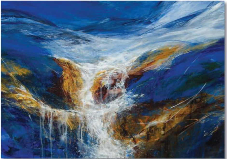
'THE FAIRY GLEN' 19" x 27" acrylic on board by ANDREW LIEVESLEY £975.00