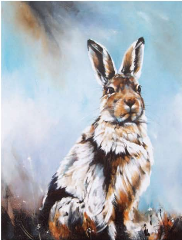
'CHANGE OF SEASONS' 32" x 24" acrylic on box canvas by PAULA VIZE £1750.00