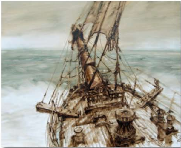
'THE BOWSPRIT' 24" x 31" oil on board by ANTHONY AMOS £1750.00