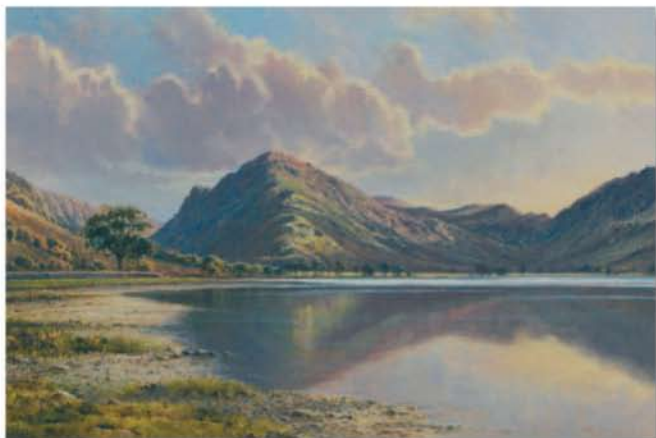
'THE STILL WATERS OF BUTTERMERE' 12" x 18" oil on board by DUNCAN PALMAR £1850.00