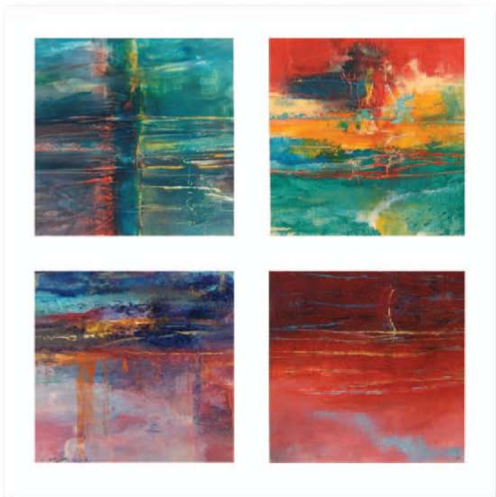
'FLOATING WORLDS' 12" x 12" x 4 oil and mixed media on paper on canvas by JOHN WALKER £1650.00